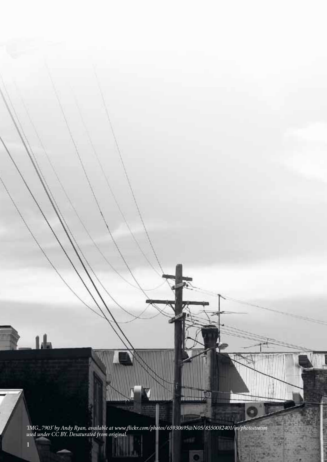
Desaturated from original.